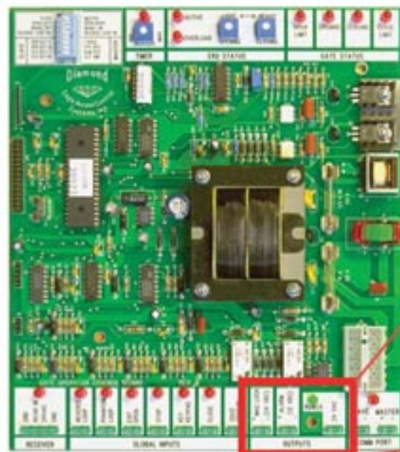
Entire Output Section