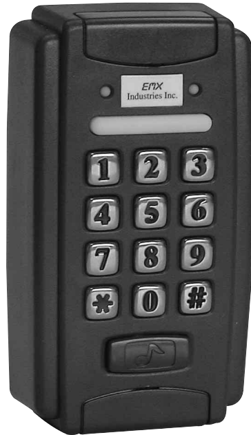
PRX- 320 (EMXPCR) Proximity & Keypad Control L=5.0" x W=2.75" x D=1.4"